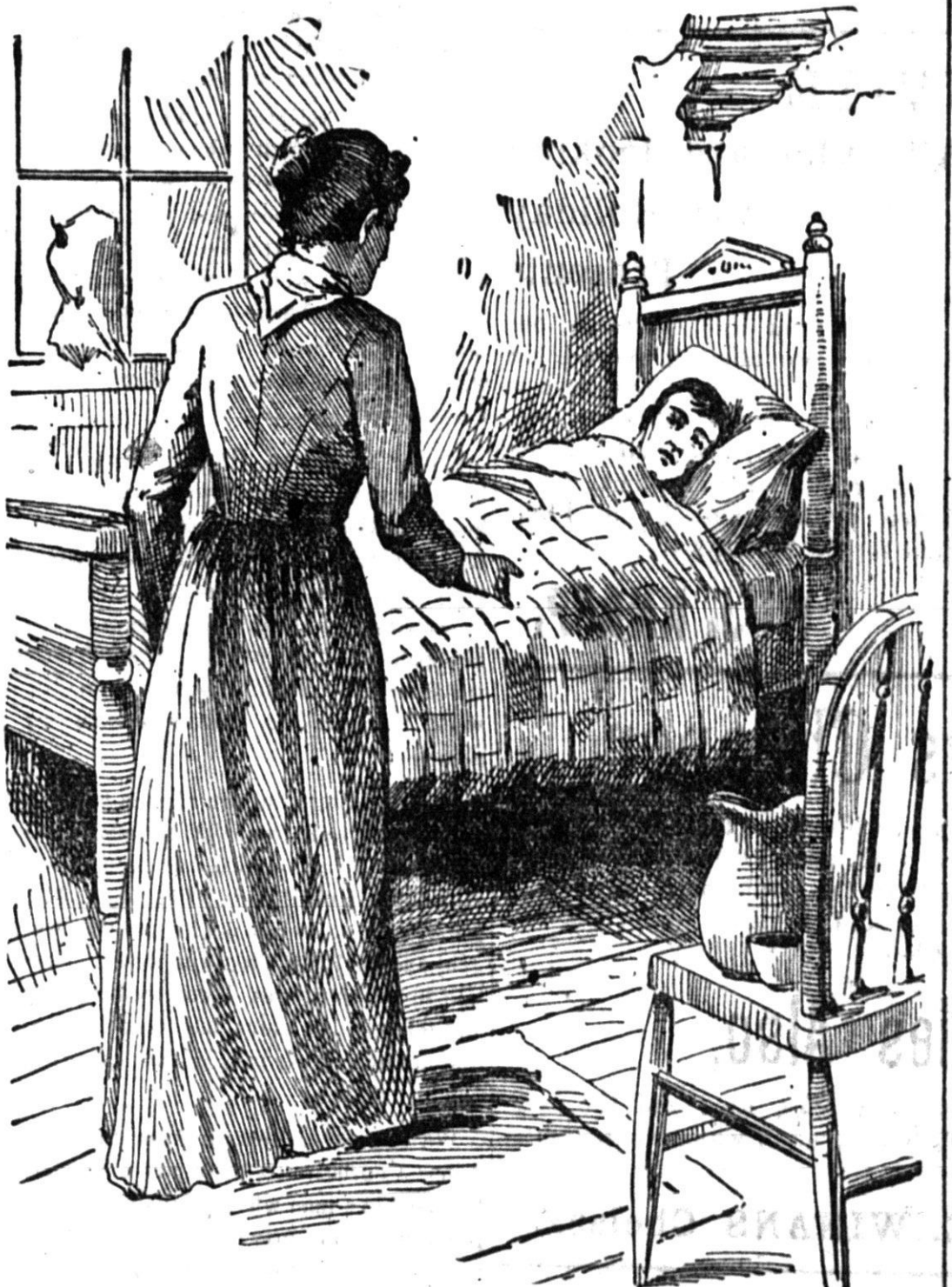
WAS IT THE LANDLORD?

"My boy, sir, and he's sick with pneumonia and I'm trying to sell his clothes to get medicine."